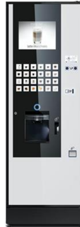
luce zero.premium 15" monitor capacitive keyboard 24 selections variflex brewer varitherm induction heater up to 2 grinders up to 9 canisters 2 cup turrets optional lid dispenser