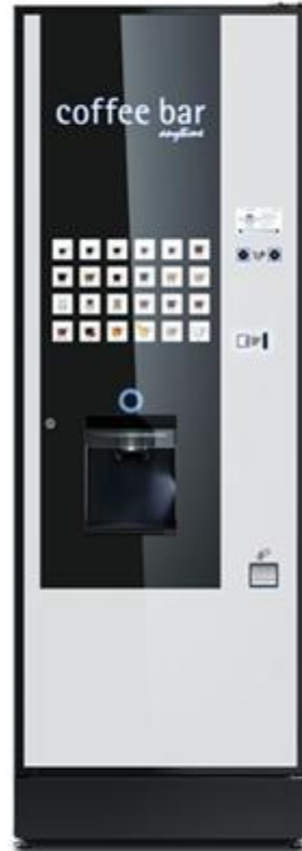
luce zero.1 capacitive keyboard 24 selections variflex brewer 1 boiler 1 grinder up to 8 canisters 1 cup turret