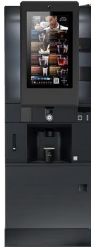
rhFS2.touch 24 24" touch screen up to 64 direct selections variflex brewer 2 boilers or Varitherm up to 2 grinders up to 2 cup turrets up to 9 canisters