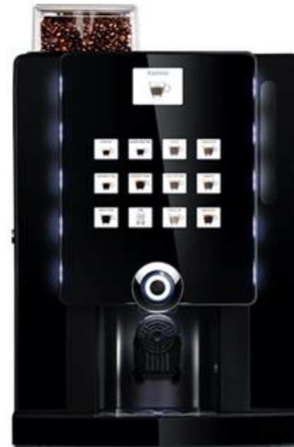
rhea BL who visible hopper 3,5" color display capacitive keyboard - 12 direct selections variflex brewer up to 5 canisters