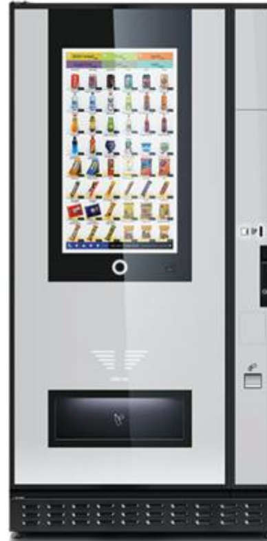
luce zero snack.touch 32" touch screen up to 48 selections capacity up to 1260 products up to 7 shelves x max 9 spirals each refrigerator unit R290 FTCA - LED flexspir