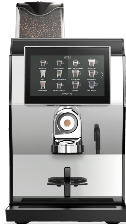
rhTT1.v+.vho available in black or inox 10" touch screen up to 48 direct selections variflex brewer varitherm induction heater up to 4 canisters Available in espresso version