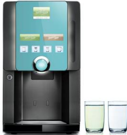
rhea COOL AQUA PLUS purified & carbonated water + concentrates 3,5" color display 2 flavours