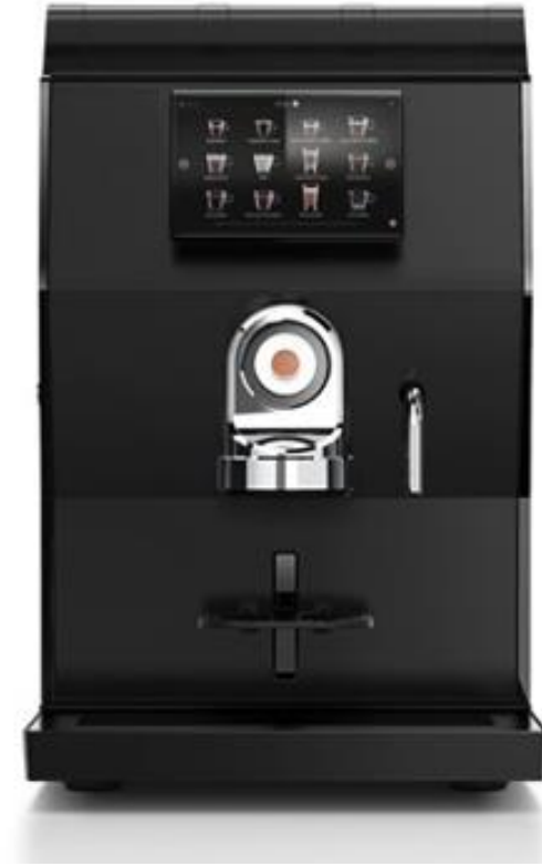
rhTT1.i available in black or inox 7" touch screen (optional 10") up to 48 direct selections 1 boiler 3,4 lt up to canisters