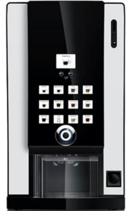
rhea BL doppio&cup 3,5" color display capacitive keyboard - 12 direct selections variflex brewer up to 6 canisters cup dispenser