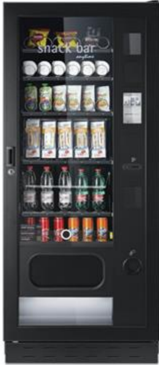
saphirh T 6/6/32 7" touch screen capacity up to 840 products up to 7 shelves max 6 spirals x shelf refrigerator unit CO2 FTCA - LED vivilight