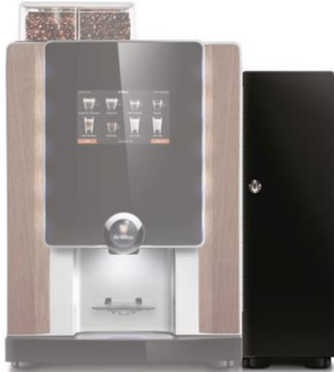
rhMM1.v+ pairable with Rhea Induction machines color black power 24V*