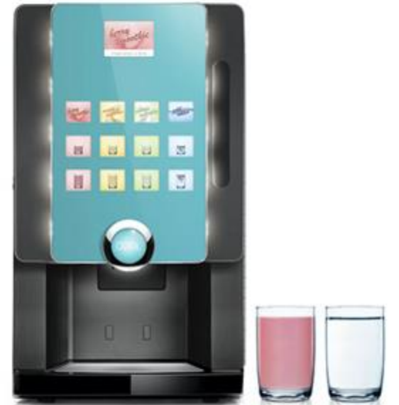
rhea COOL MIX purified water + instant powders smoothie drinks 3,5" color display 3 canisters