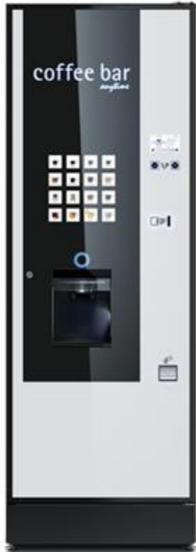
luce zero.0 capacitive keyboard 16 selections variflex brewer 1 boiler 1 grinder up to 7 canisters 1 cup turret