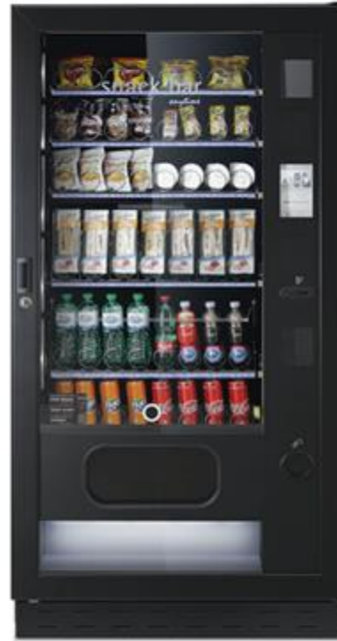
saphirh T 8/6/43 C 7" touch screen capacity up to 1120 products up to 7 shelves max 8 spirals x shelf refrigerator unit CO2 FTCA - LED vivilight