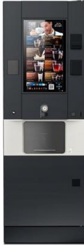
rhFS1.touch 21,5 21.5" touch screen up to 64 direct selections variflex brewer 1 boiler or Varitherm 1 grinder up to 2 cup turrets up to 8 canisters