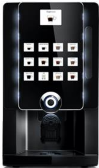
rhea BL eC 3,5" color display capacitive keyboard - 12 direct selections variflex brewer up to 3 canisters variflex