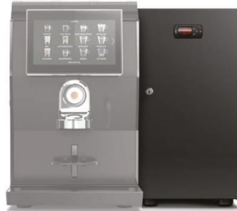
rhMM2.v+ pairable with Rhea Induction machines Integrated cooling unit - 4l capacity refrigerated gas R600 color black power 24V*

*rhMM range works with the induction heating system of the machine