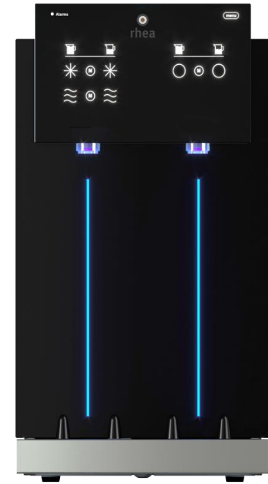
rH2O.150 available in black purified & carbonated water 3 water direct selections portion control