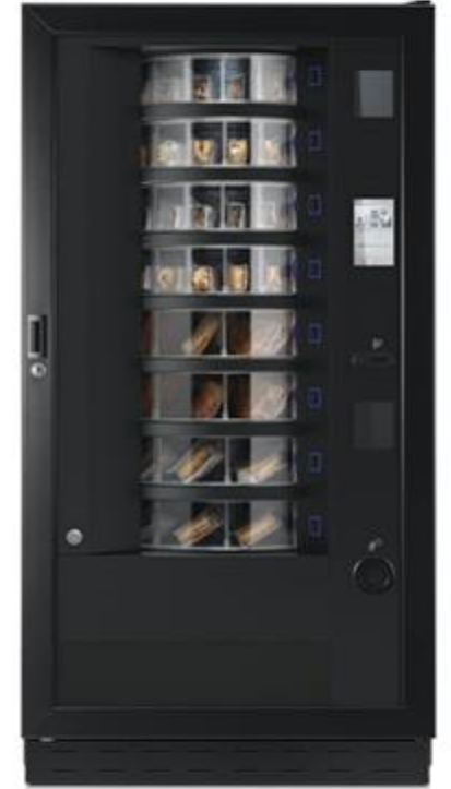
saphirh shop T 8/144 7" touch screen capacity up to 384 products 8 floors refrigerator unit CO2 vivilight