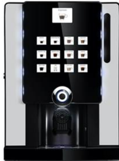
rhea BL grande 3,5" color display capacitive keyboard - 12 direct selections variflex brewer up to 5 canisters variflex