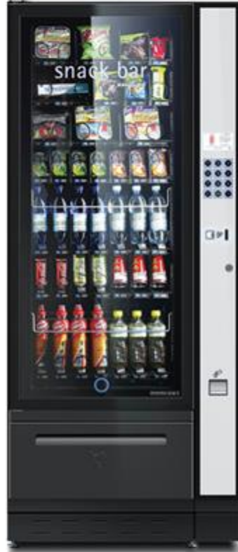
luce zero air snack 12 buttons capacitive keyboard 4,3" color display capacity up to 1120 products up to 7 shelves x max 7 spirals each refrigerator unit R290 FTCA - LED flexspir lift to sell fragile products