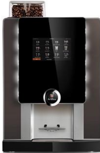
laRhea V+ grande premium 7" touch screen up to 48 direct selections variplus technology 1 grinder up to 5 canisters