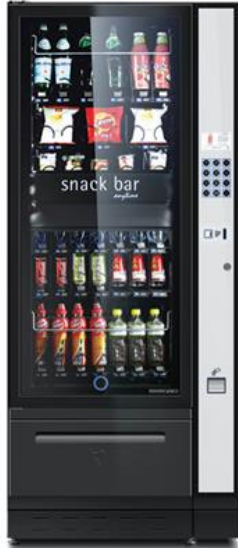
luce zero snack 12 buttons capacitive keyboard 4,3" color display capacity up to 1120 products up to 8 shelves x max 7 spirals each refrigerator unit R290 FTCA - LED flexspir