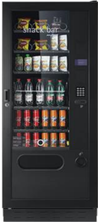
saphirh 6/6/31 480x272 pixel color display capacity up to 840 products up to 7 shelves max 6 spirals x shelf refrigerator unit CO2 FTCA - LED vivilight