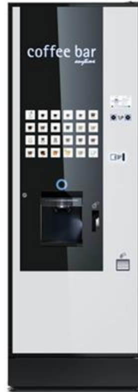
luce zero.2 capacitive keyboard 24 selections variflex brewer varitherm induction heater up to 2 grinders up to 9 canisters 2 cup turrets optional lid dispenser