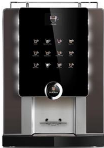
laRhea V+ grande 3,5" colour display capacitive keyboard - 12 direct selections variplus technology 1 grinder up to 5 canisters