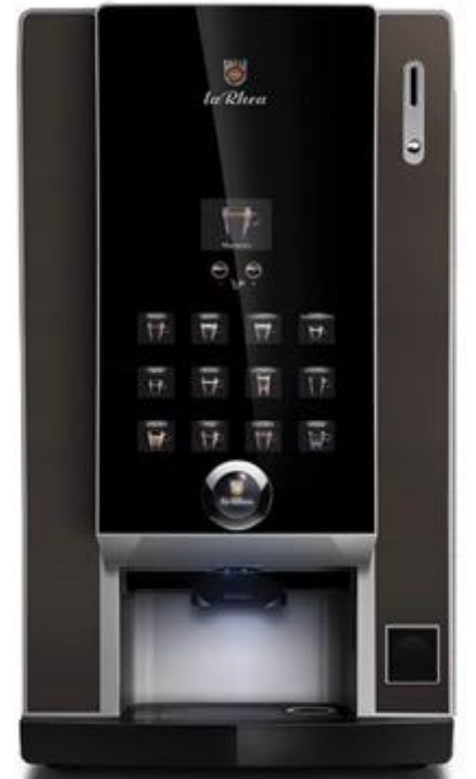
laRhea V+ doppio&cup 3,5" colour display capacitive keyboard - 12 direct selections variplus technology 1 grinder up to 6 canisters cup dispenser