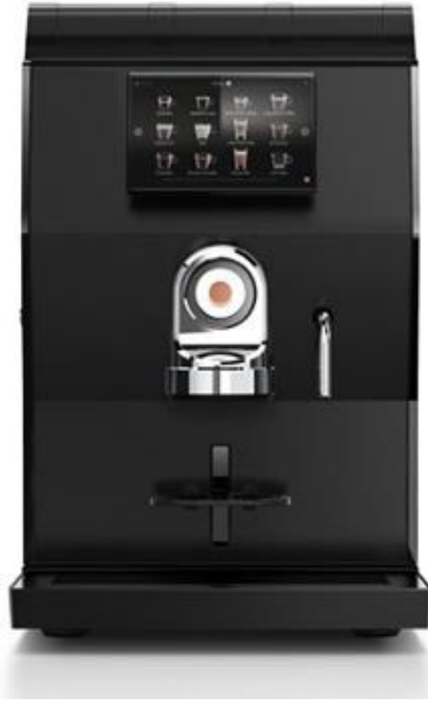
rhTT1.v+ available in black or inox 7" touch screen (optional 10") up to 48 direct selections variflex brewer varitherm induction heater up to 5 canisters Available in instant and espresso version