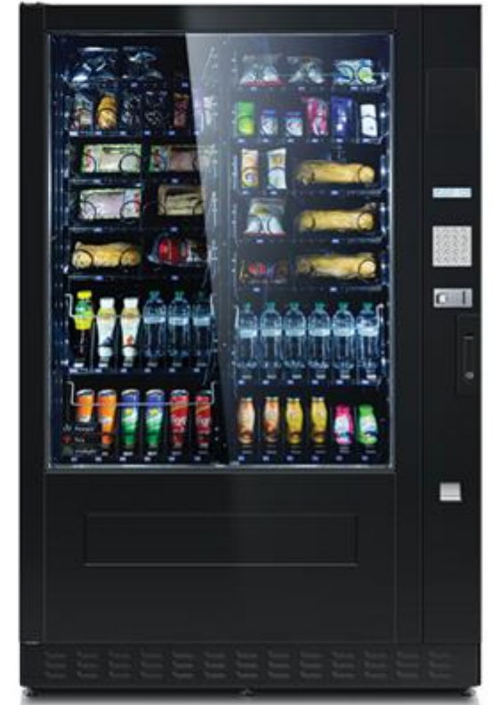
luce XL6 multishop 24 buttons capacitive keyboard display 16x2 capacity up to 1680 products up to 14 shelves x max 6 spirals each refrigerator unit R290 FTCA - LED optional flexspir