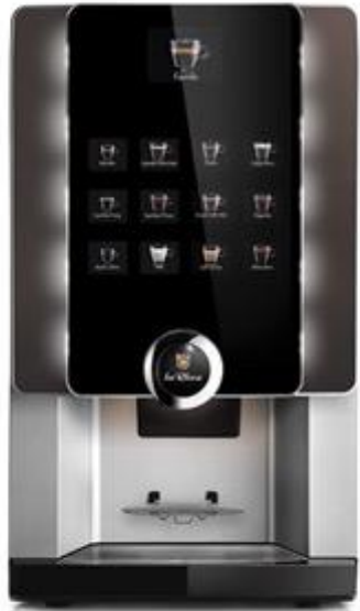
laRhea V+ eC 3,5" colour display capacitive keyboard - 12 direct selections variplus technology 1 grinder up to 3 canisters