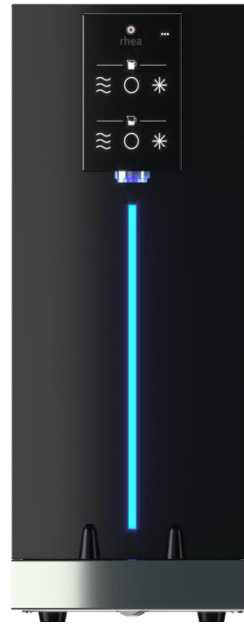
rH2O.60 available in black purified & carbonated water 3 water direct selections portion control