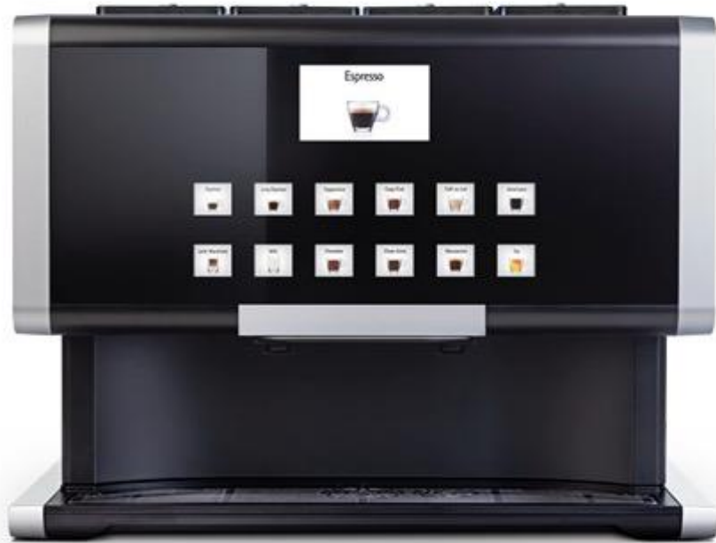
rhTT3.pro 4,3" multicolor display capacitive keyboard - up to 12 direct selections 4 canisters with the possibility of extension