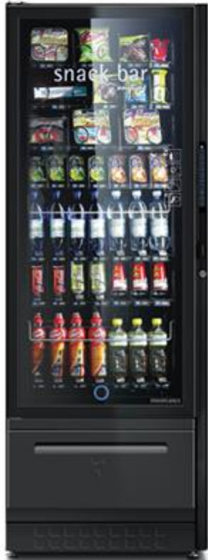
luce zero side snack slave machine capacity up to 1120 products up to 8 shelves x max 7 spirals each refrigerator unit R290 FTCA - LED flexspir