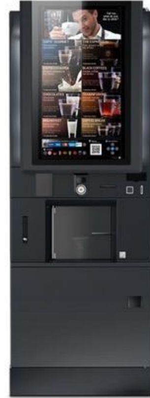
rhFS2.touch 32 32" touch screen up to 64 direct selections variflex brewer 2 boilers or Varitherm up to 2 grinders up to 2 cup turrets up to 9 canisters