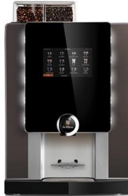
laRhea V+ grande 2 premium 7" touch screen up to 48 direct selections variplus technology 2 grinders up to 5 canisters