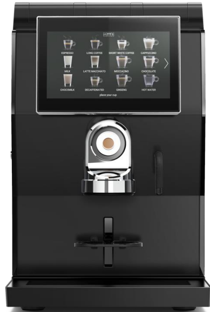
rhTT1.v+ available in black or inox 7" touch screen (optional 10") up to 48 direct selections variflex brewer varitherm induction heater up to 5 canisters Available in instant and espresso version