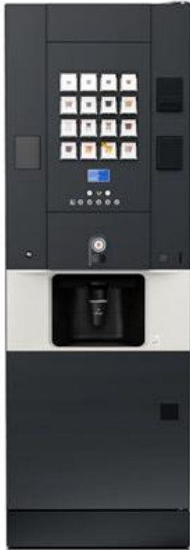
rhFS1.buttons selection keyboard up to 16 direct selections variflex brewer 1 boiler or Varitherm 1 grinder up to 2 cup turrets up to 8 canisters