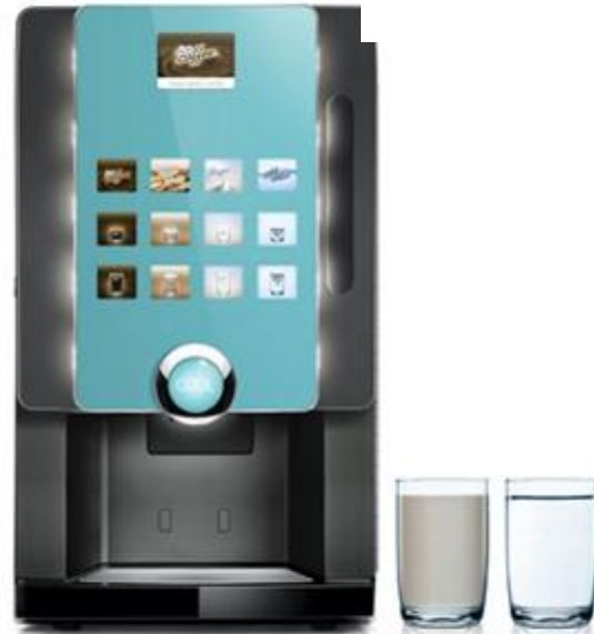
rhea COOL MIX purified water + instant powders summertime drinks 3,5" color display 3 canisters