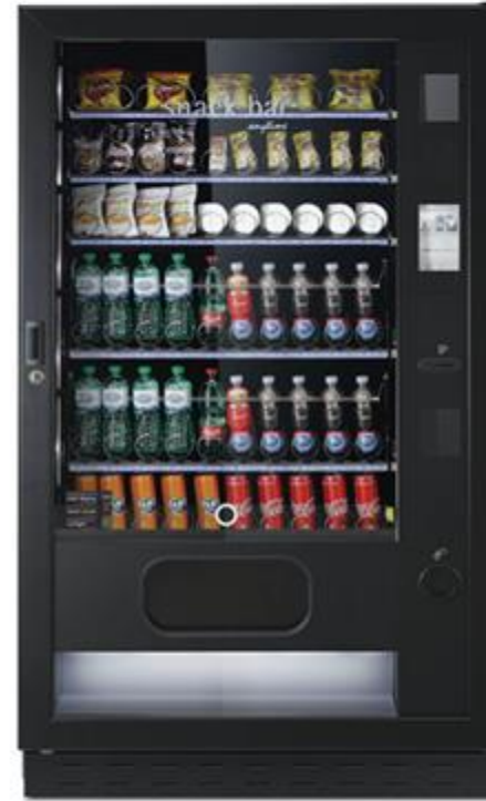
saphirh T 10/6/55C 7" touch screen capacity up to 1400 products up to 7 shelves max 10 spirals x shelf refrigerator unit CO2 FTCA - LED vivilight