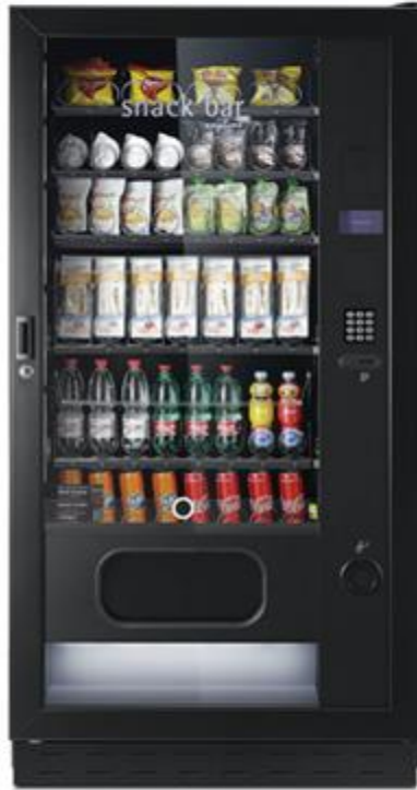
saphirh 8/6/43 C 480x272 pixel color display capacity up to 1120 products up to 7 shelves max 8 spirals x shelf refrigerator unit CO2 FTCA - LED vivilight