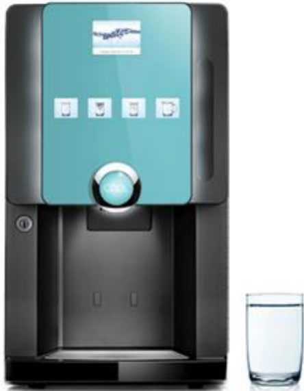
rhea COOL AQUA purified & carbonated water 3,5 colour display 4 water direct selections