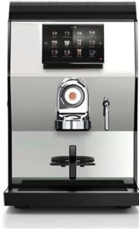
rhTT1.e available in black or inox 7" touch screen (optional 10") up to 48 direct selections 1 boiler 500 cc variflex up to 5 canisters