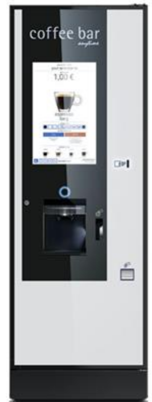
luce zero.touch touch screen up to 64 selections variflex brewer varitherm induction heater up to 2 grinders up to 9 canisters 2 cup turrets lid dispenser